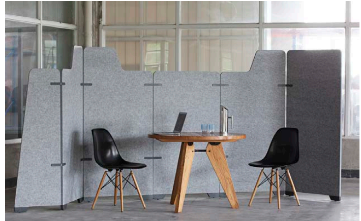
Wrap Partition | Color 442 (Grey) with Charcoal Hardware