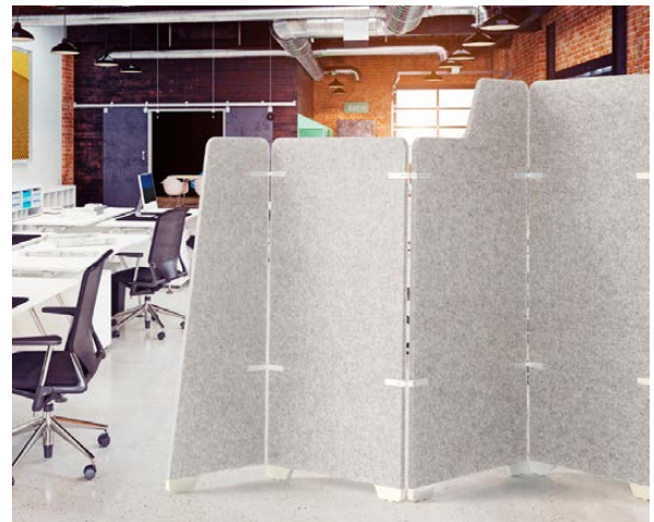
Wrap Partition | Color 454 (Mushroom) with Cream Hardware

CDPH (CA 01350) Compliant; TVOC: <0.5 mg/m3 Ecospecifier GreenTag Compliant; TVOC: 0.015 mg/m2/hr (ASTM D5116)