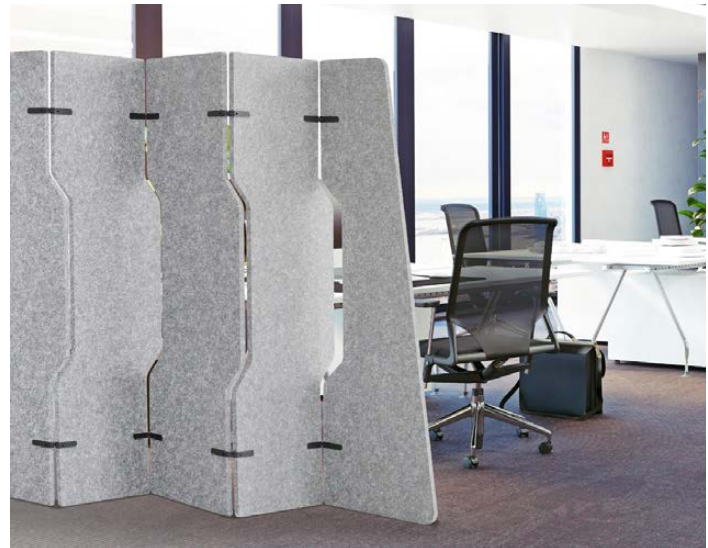
Platoon Partition I Color 442 (Grey) with Charcoal Hardware