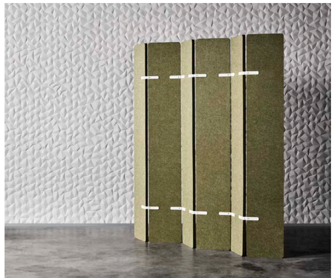
Paling Partition I Color 384 (Olive) with Cream Hardware

CDPH (CA 01350) Compliant; TVOC: <0.5 mg/m3 Ecospecifier GreenTag Compliant; TVOC: 0.015 mg/m2/hr (ASTM D5116)