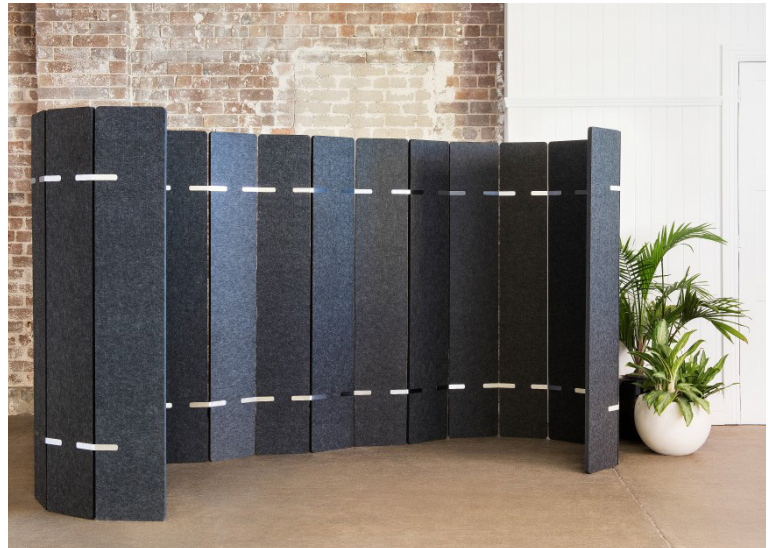
Paling Partition I Color 542 (Black) with Cream Hardware