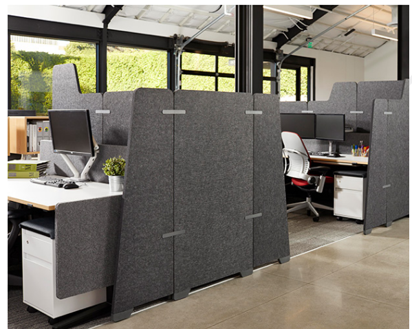
EchoScreen Wrap | Color 542 (Charcoal) with Cream Hardware

CDPH (CA 01350) Compliant; TVOC: <0.5 mg/m3 Ecospecifier GreenTag Compliant; TVOC: 0.015 mg/m2/hr (ASTM D5116)