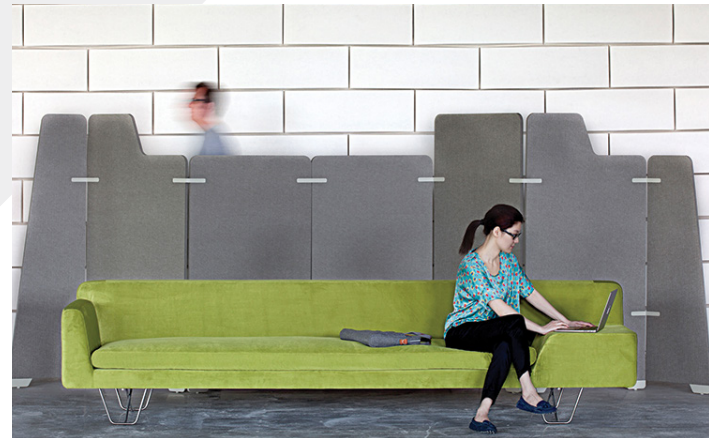
EchoScreen Wrap | Color 444 (Gray) with Cream Hardware