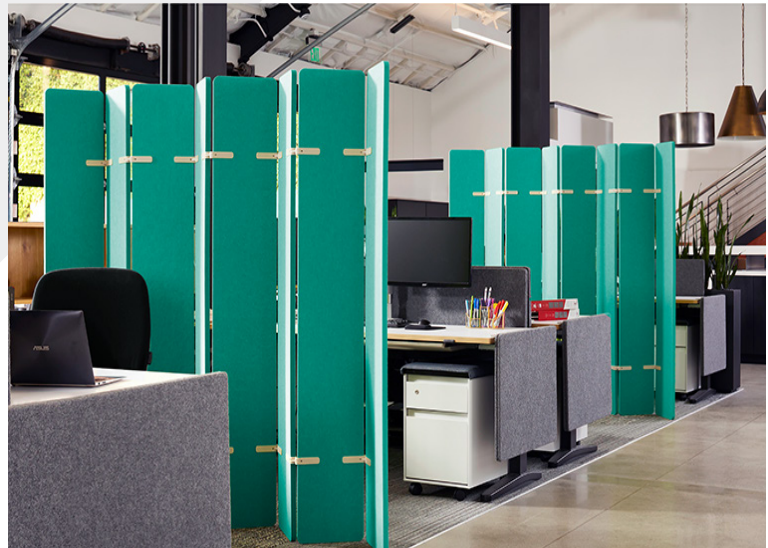
EchoScreen Paling | Color 325 (Viridian Green) with Cream Hardware