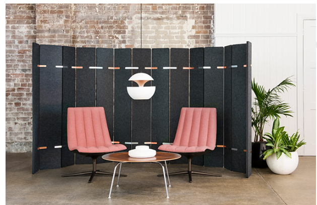
EchoScreen Paling | Color 542 (Charcoal) with Copper Hardware

CDPH (CA 01350) Compliant; TVOC: <0.5 mg/m3 Ecospecifier GreenTag Compliant; TVOC: 0.015 mg/m2/hr (ASTM D5116)