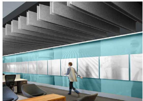
H Baffle | Color 444 (Smoke)

CDPH (CA 01350) Compliant; TVOC: <0.5 mg/m 3 Ecospecifier GreenTag Compliant; TVOC: 0.015 mg/m 2 /hr (ASTM D5116)