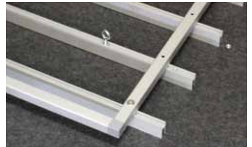
6. Position the extra Hex Nuts and thread in Eyebolt or Set Screw for connecting to the specified suspension system.

Based on specifics of location height, type of mounting hardware and available equipment, the installer may pre-assemble the Rack at ground level with only 2 or 3 Channels and hanging hardware pre-mounted, and complete the assembly of remaining components while suspended.