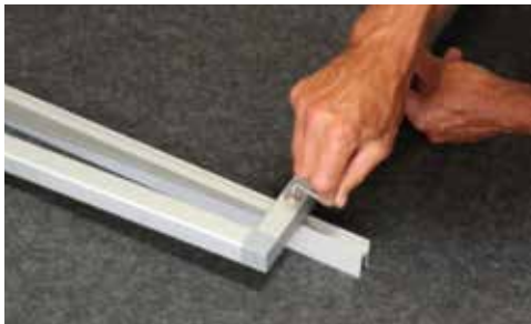
4. Insert Joint Connector Bolt, align to Nut and hand thread. Using a hex driver, tighten while maintaining the Frame and Channel aligned properly.