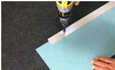
2. Place screw in pre-drilled hole of channel and fasten.