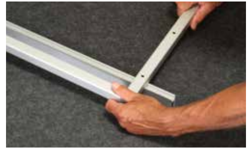
3. Place Channel underneath the frame, slide in hex nuts for assembly (add 2 extra and slide towards center for the Channel positions that are to be used for suspending the EchoSky)