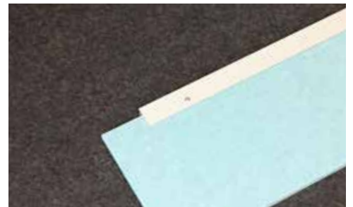
3. Complete channel/baffle set is now ready to mount on rack.