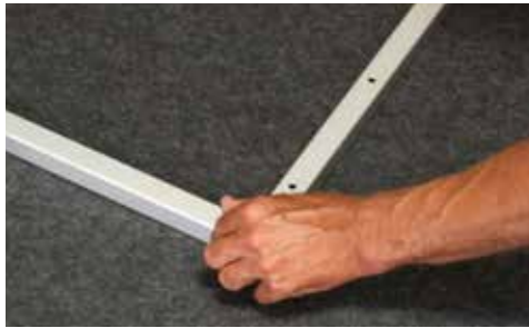
2. Using a white rubber mallet, drive the Tube Connectors fully into the tube ends. Be sure to protect the tube from hard surfaces and denting during assembly.