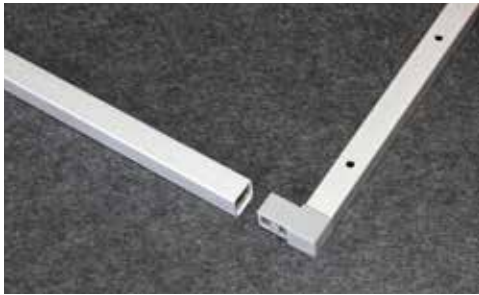
1. Lay out the Tube Frame on a clean, protective surface with the holes facing up.