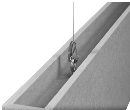
Eyebolt Mounting Hardware