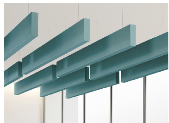
O-Baffle | Color 551 (Teal)

CDPH (CA 01350) Compliant; TVOC: <0.5 mg/m 3 Ecospecifier GreenTag Compliant; TVOC: 0.015 mg/m 2 /hr (ASTM D5116)