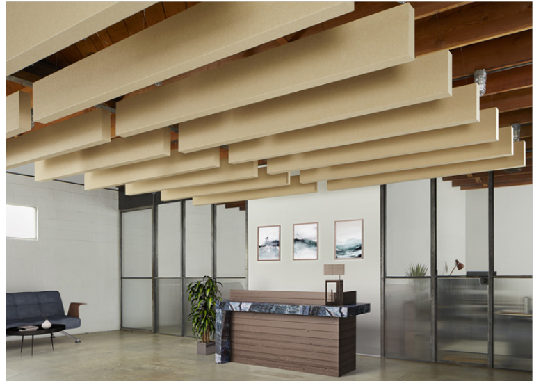
O-Baffle | Color 468 (Vanilla)