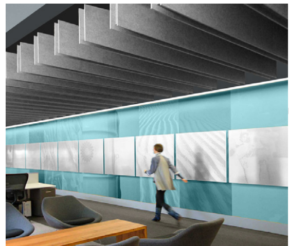
H-Baffle I Color 444 (Gray)

CDPH (CA 01350) Compliant; TVOC: <0.5 mg/m3 Ecospecifier GreenTag Compliant; TVOC: 0.015 mg/m2/hr (ASTM D5116)