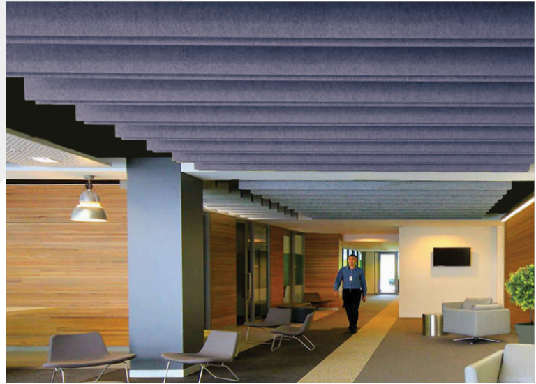
H-Baffle I Color 276 (Lavender)