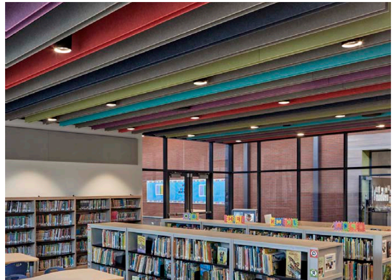
H-Baffle | Colors 258 (Red), 325 (Viridian Green), 365 (Navy), 444 (Grey), 576 (Magenta), & 579 (Olive Green)