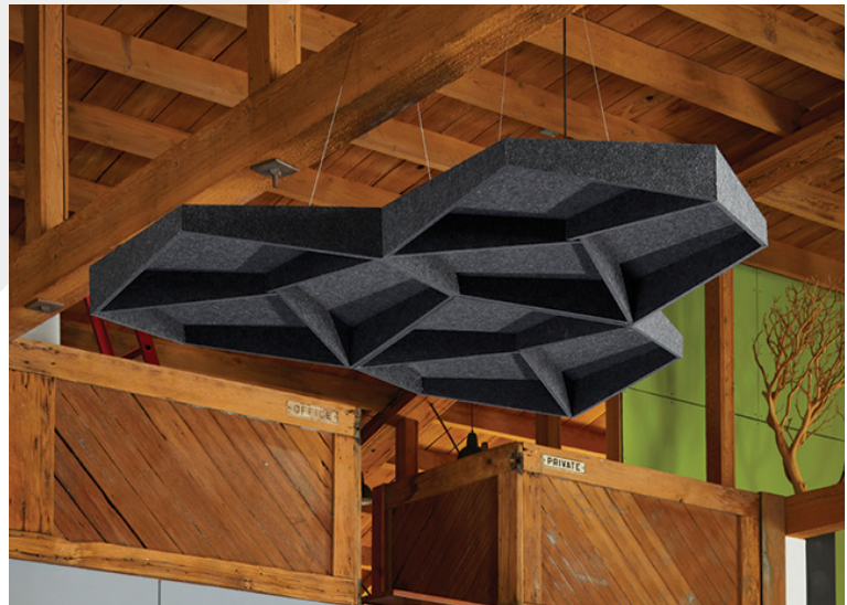
EchoCloud 3D Hex | Color 542 (Charcoal)