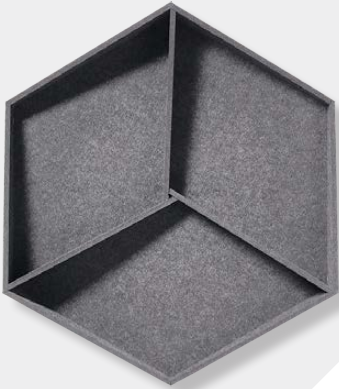
EchoCloud 3D Hex | Color 444 (Gray)