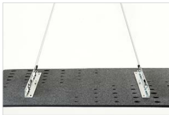
Cloud Track Installation