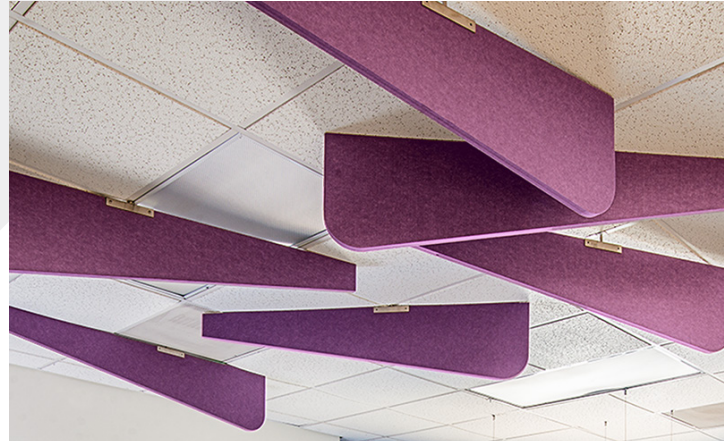
EchoBlade Swoop 47 | Color 576 (Magenta)