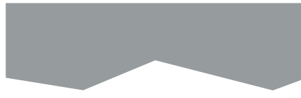
Rockies 23 D | 23" x 6.8" (Max)