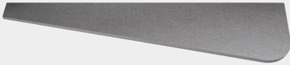
EchoBlade Swoop 47 | Color 444 (Gray)