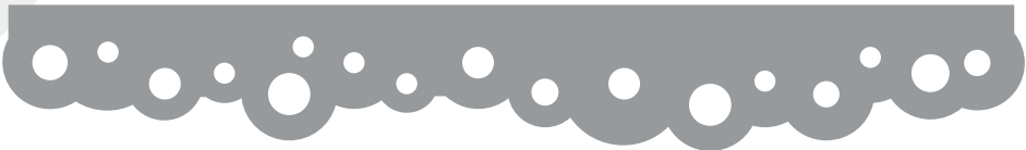
Tiny Bubbles 47 | 47" x 6.8"