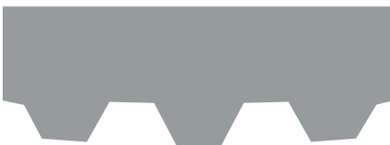
Gears 23 C | 23" x 8.3"