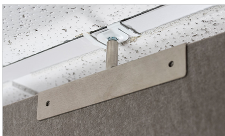
T-Grip Hardware with FUC Bracket