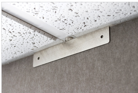
Magnetic Hardware with DUC Bracket