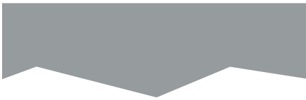
Rockies 23 C | 23" x 7.1" (Max)