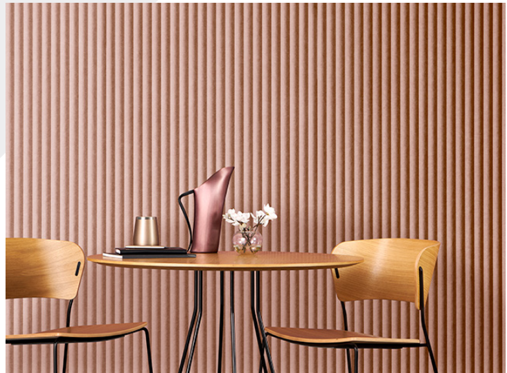
Zen | Color 167 (Cinnamon)