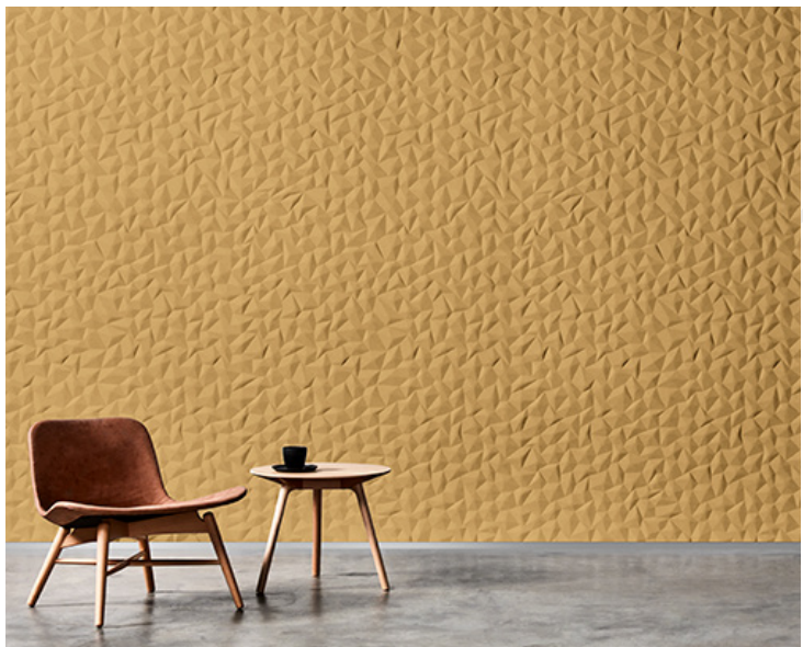
Ion | Color 124 (Ochre)

ASTM D5116 Rate: 0.023 mg/m 2 /hr (7 days)