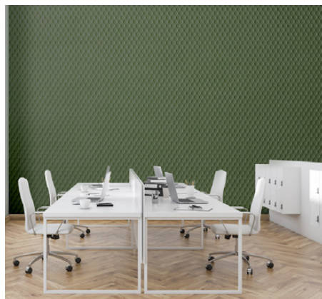
Gem | Color 349 (Vineyard)