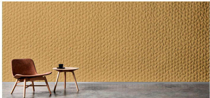
Ion | Color 124 (Ochre)

ASTM D5116 Rate: 0.023 mg/m 2 /hr (7 days)