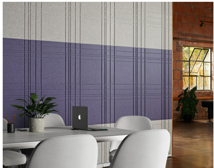
Tartan Tiles | Colors 276 (Lavender), 444 (Gray)

CDPH (CA 01350) Compliant; TVOC: <0.5 mg/m3 Ecospecifier GreenTag Compliant; TVOC: 0.015 mg/m2/hr (ASTM D5116)