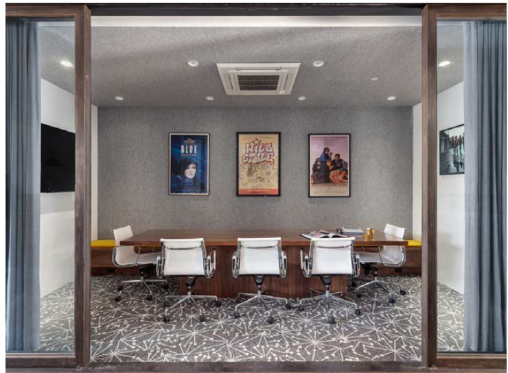
EchoPanel Solids | Color 442 (Speckled Gray)