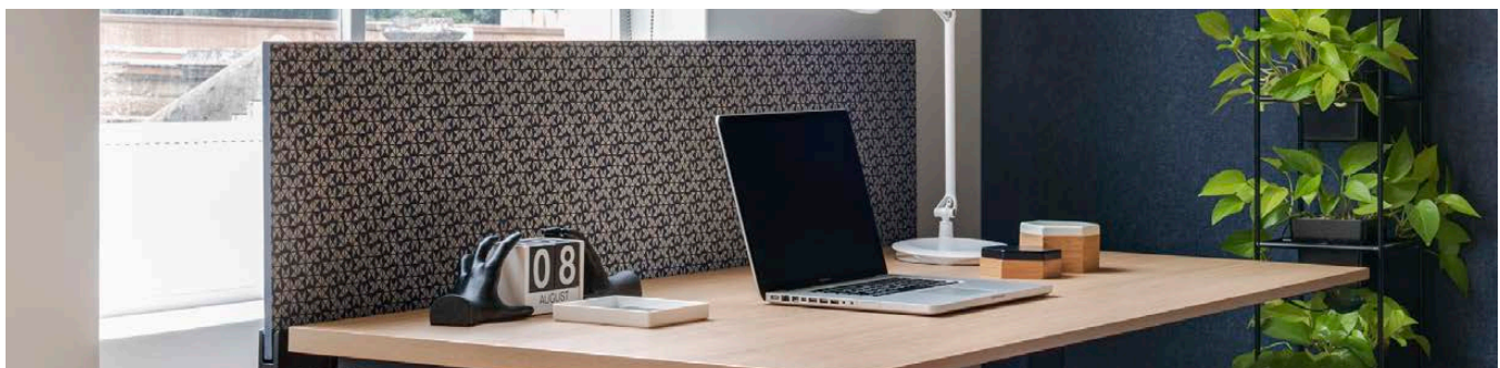
EchoPanel Prints | Pattern Trio 365

Please note that not all colors come in all thicknesses. Refer to the sample board for color and size availability.