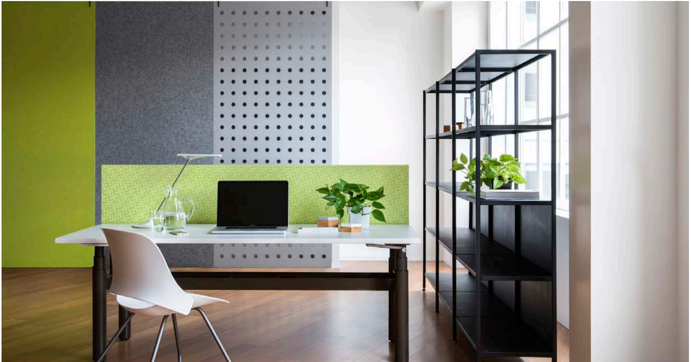
EchoPanel Solids & Prints | Colors 381 (Lime Green), 444 (Gray), Pattern Trio 381