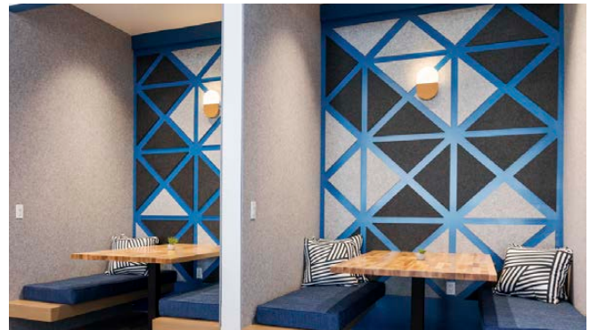
EchoPanel Solids Custom Cut | Colors 442 (Speckled Gray), 542 (Charcoal)

For instructions on how to install EchoPanel panels in a variety of ways, please visit our website and download our EchoPanel Panel Installation Guide.