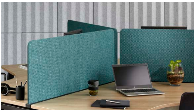
EchoPanel Prints | Pattern Astro 462