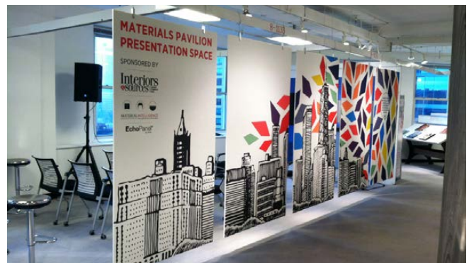
EchoPanel Solids Custom Print | Color 500 (White)

EchoPanel can be digitally printed and custom cut with CNC, laser, water-jet or hand knife to make your design ideas come to life. For information on custom printing and cutting of EchoPanel, please contact Kirei.