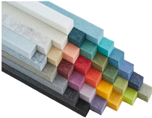
EchoPanel Solids | Color Options