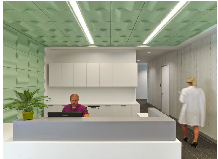
EchoTile Wave | Color 577 (Eucalyptus)