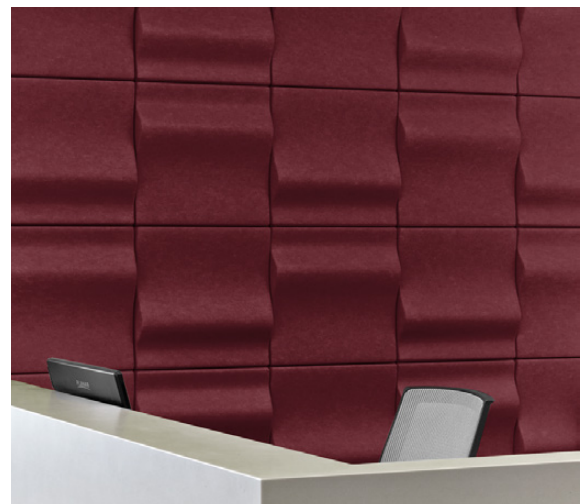
EchoTile Wave | Color 269 (Wine)

CDPH (CA 01350) Compliant; TVOC: <0.5 mg/m 3 Ecospecifier GreenTag Compliant; TVOC: 0.015 mg/m 2 /hr (ASTM D5116)