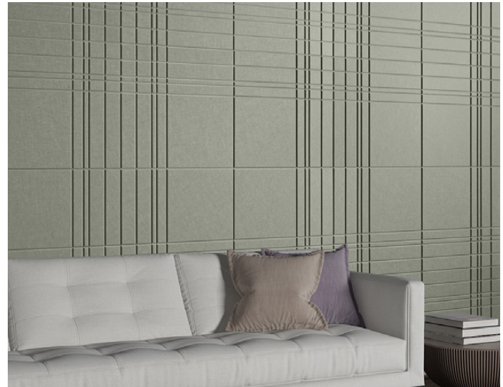
EchoTile Tartan | Color 580 (Sage)