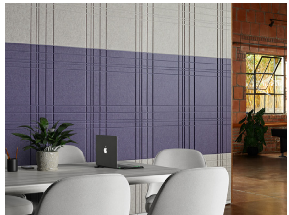
EchoTile Tartan | Colors 276 (Lavender), 444 (Gray)

Ecospecifier GreenTag Compliant; TVOC: 0.015 mg/m 2 /hr (ASTM D5116)