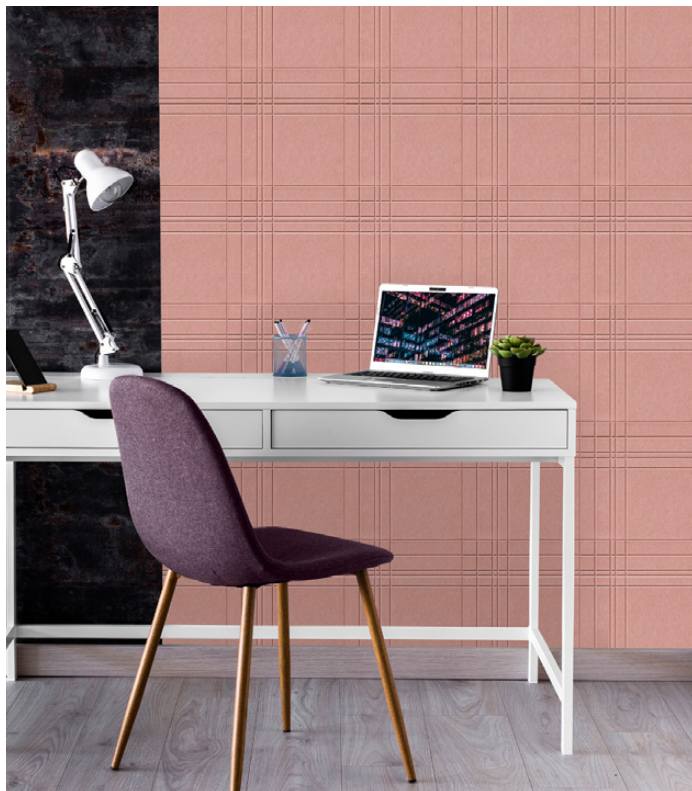
EchoTile Tartan | Colors 487 (Blush)