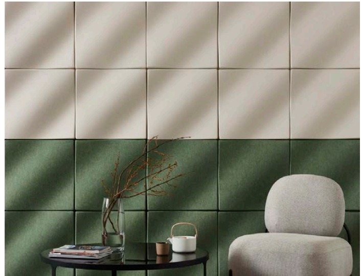
Dune Tiles | Colors 349 (Vineyard) & 908 (Ivory)