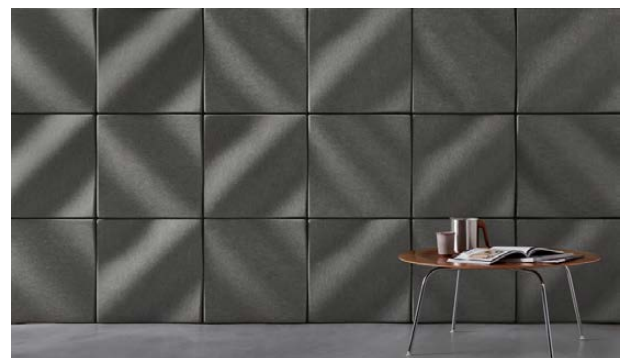
Dune Tiles | Color 444 (Grey)

CDPH (CA 01350) Compliant; TVOC: <0.5 mg/m 3 Ecospecifier GreenTag Compliant; TVOC: 0.015 mg/m 2 /hr (ASTM D5116)