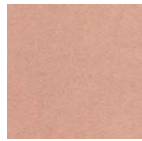
487 | Blush