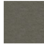
402 | Taupe