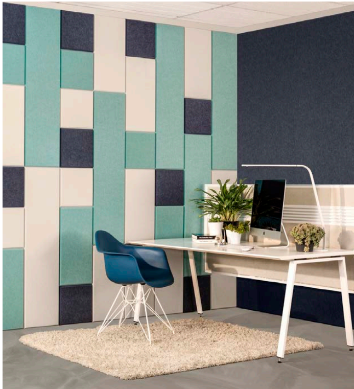
Balance Tiles 325, 600, & 1300 | Colors 325 (Viridian Green), 365 (Navy), 908 (Ivory)