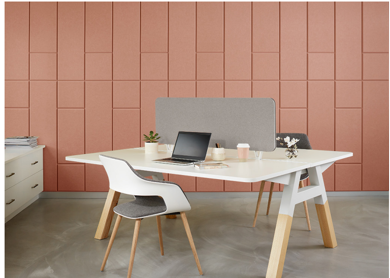
Balance Tiles 325, 600, & 1300 | Color 487 (Blush)