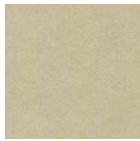
468 | Vanilla