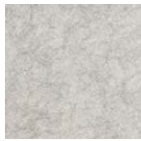
454 | Mushroom