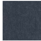
365 | Navy