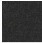
542 | Charcoal