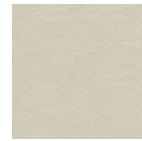
908 | Ivory