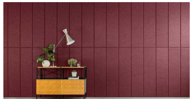
Balance Tile 1300 | Color 269 (Wine)

ASTM D5116 Rate: <0.02 mg/m 2 /hr (7 days)