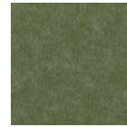
384 | Seaweed