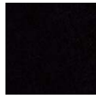
550 | Onyx