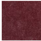
269 | Wine