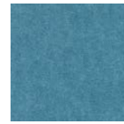
633 | Pacific