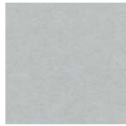
101 | Frost