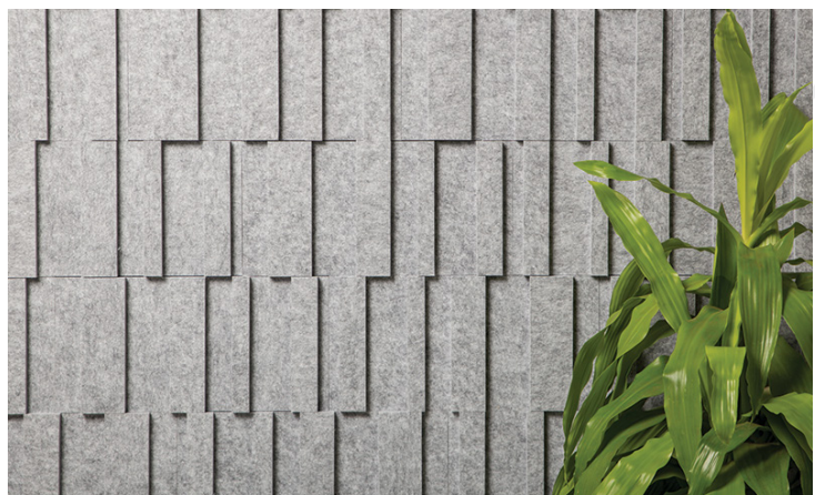
Topo Tile: Barcode | Color 442 (Speckled Gray)

CDPH (CA 01350) Compliant; TVOC: <0.5 mg/m3 Ecospecifier GreenTag Compliant; TVOC: 0.015 mg/m2/hr (ASTM D5116)