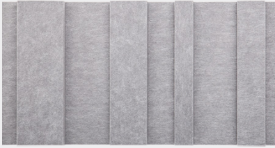
Topo Tile: Barcode | Color 444 (Gray)