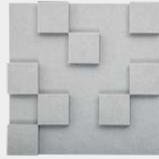
Topo Tile: Pixel