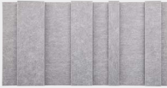
Topo Tile: Barcode