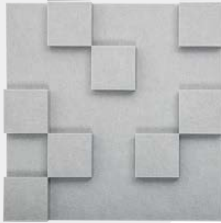
Topo Tile: Pixel | Color 101 (Frost)