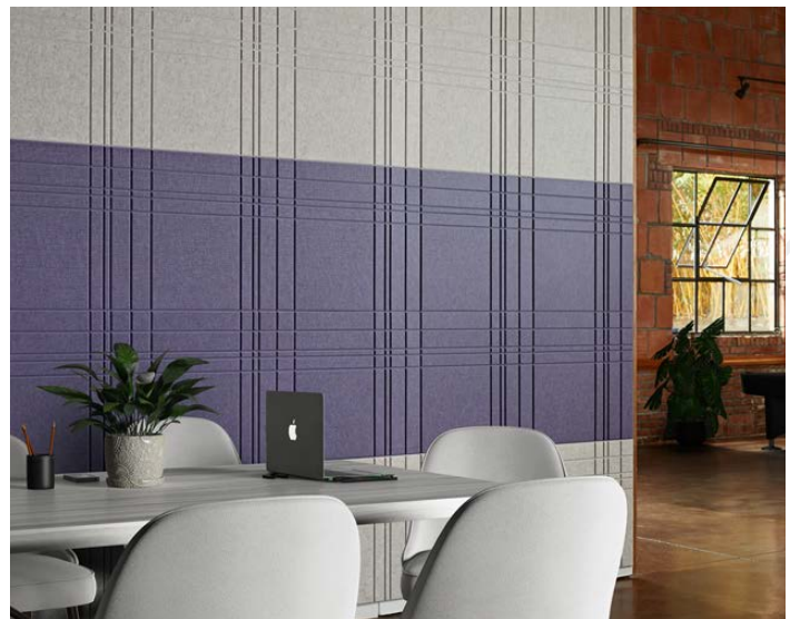
Tartan Tiles | Colors 276 (Lavender), 444 (Gray)

CDPH (CA 01350) Compliant; TVOC: <0.5 mg/m3 Ecospecifier GreenTag Compliant; TVOC: 0.015 mg/m2/hr (ASTM D5116)