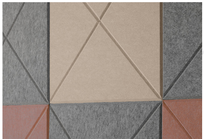
Vee Tiles | Colors 444 (Gray), 468 (Vanilla), 487 (Blush)

CDPH (CA 01350) Compliant; TVOC: <0.5 mg/m 3 Ecospecifier GreenTag Compliant; TVOC: 0.015 mg/m 2 /hr (ASTM D5116)