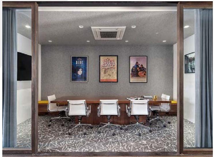
EchoPanel Solids | Color 442 (Speckled Gray)