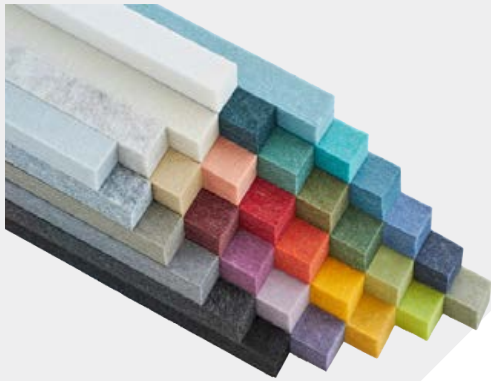
EchoPanel Solids | Color Options