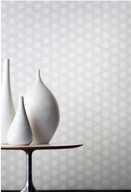
EchoPanel Prints | Pattern Hex 444