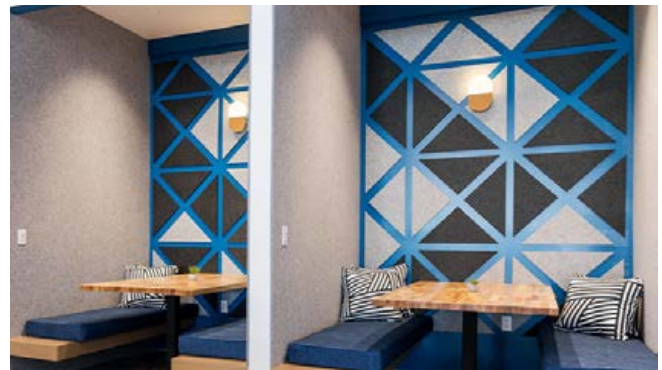
EchoPanel Solids Custom Cut | Colors 442 (Speckled Gray), 542 (Charcoal)

For instructions on how to install EchoPanel panels in a variety of ways, please visit our website and download our EchoPanel Panel Installation Guide.