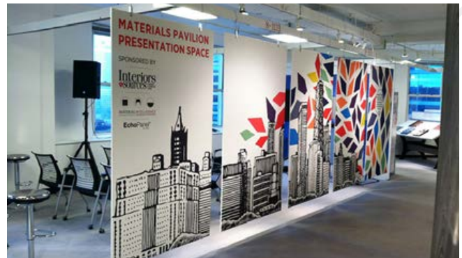
EchoPanel Solids Custom Print | Color 500 (White)

EchoPanel can be digitally printed and custom cut with CNC, laser, water-jet or hand knife to make your design ideas come to life. For information on custom printing and cutting of EchoPanel, please contact Kirei.