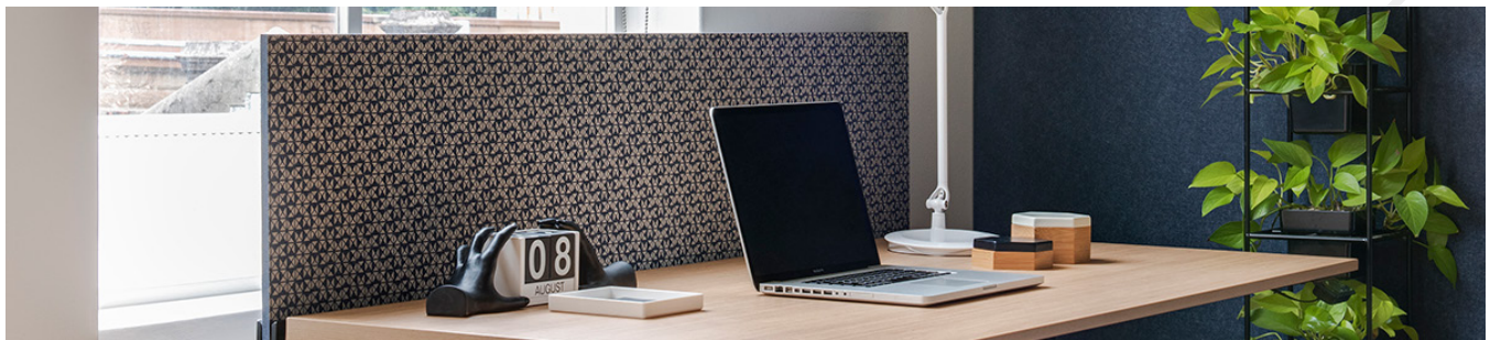
EchoPanel Prints | Pattern Trio 365

Please note that not all colors come in all thicknesses. Refer to the sample board for color and size availability.