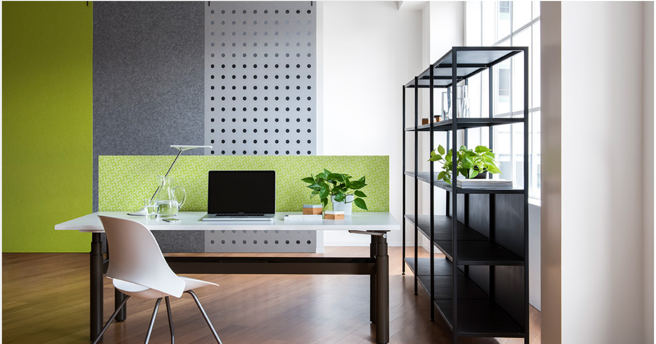
EchoPanel Solids & Prints | Colors 381 (Lime Green), 444 (Gray); Pattern Trio 381