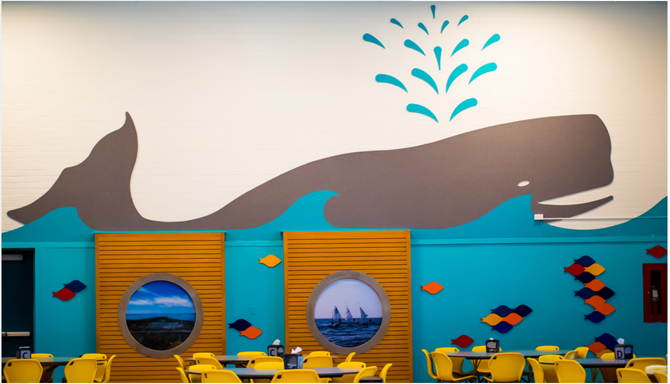
EchoPanel Solids Custom Cut | Colors 325 (Viridian Green), 444 (Gray)