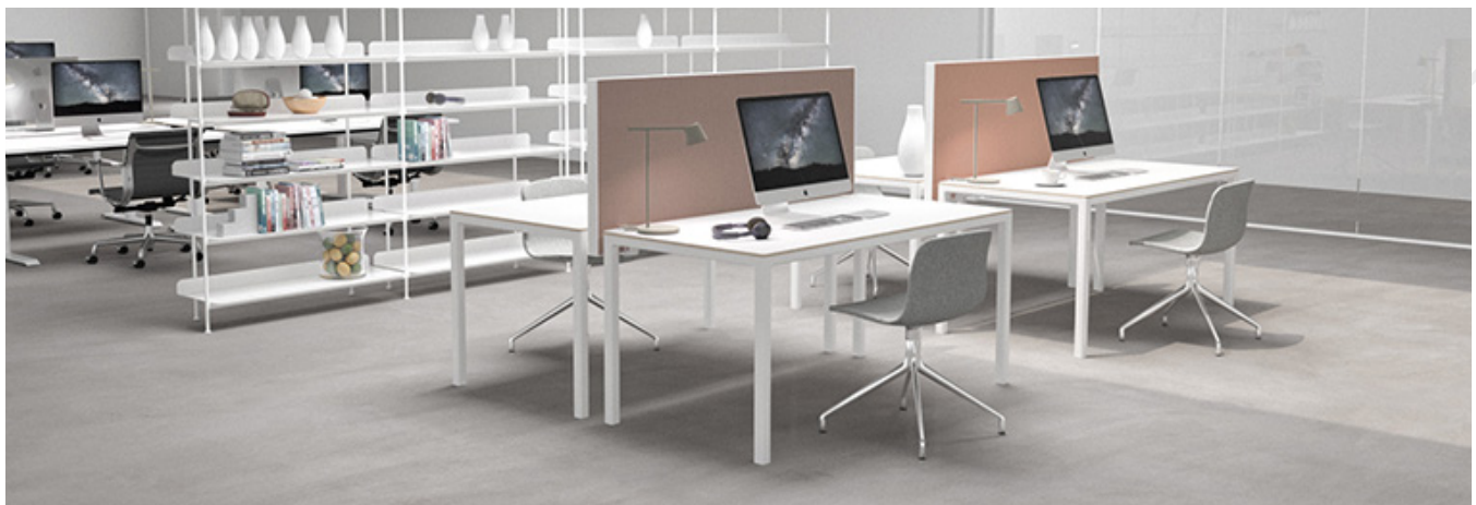
Shelter Me (Custom Art)