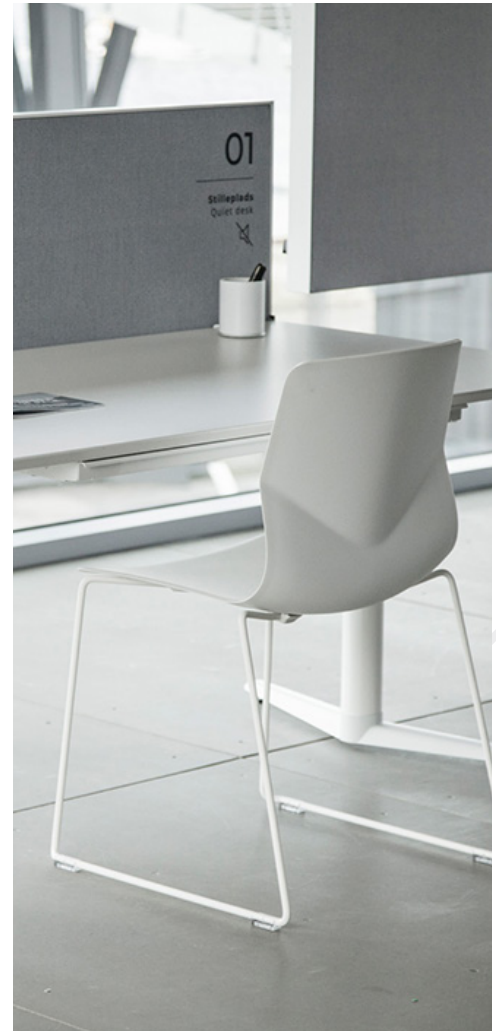
Shelter Me (Wayfinding)

Standard Shelter Me panels are 25" tall with 1.97" (50mm) thickness. They fit table top edges up to 1.57" (40mm) and beveled table top edges up to 1.18" (30mm). Custom sizes are available up to 94" x 39" (length x height). The maximum size for assembled Shelter Me products is 78" x 25".