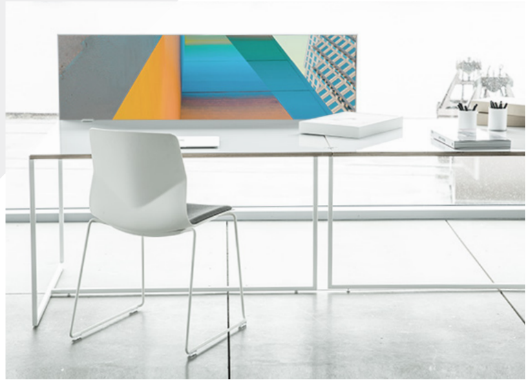
Shelter Me (Custom Art)