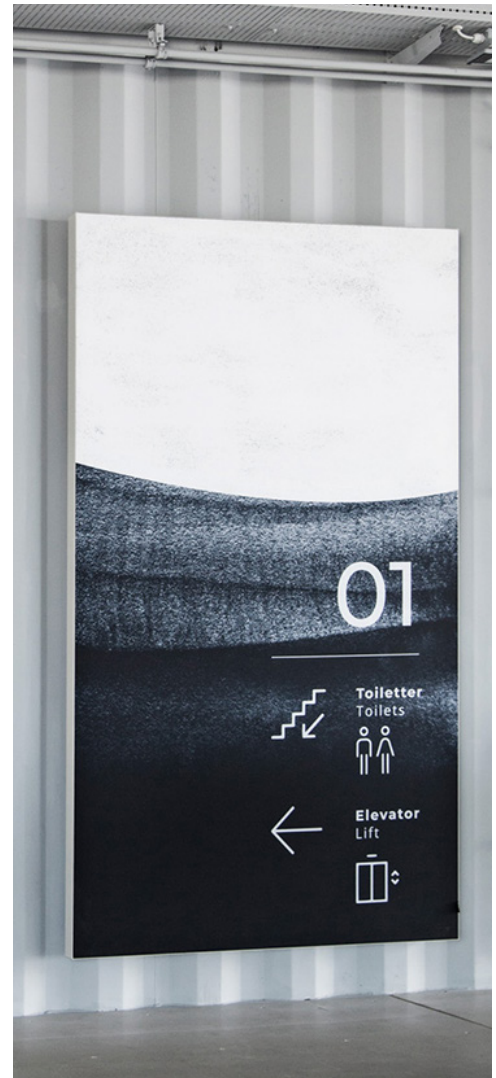
On The Wall (Wayfinding)

Standard On The Wall frames can be specified as portrait or landscape. Custom sizing is available with a minimum of 8" x 8" and a maximum single panel of 236" x 118" (length x height). The maximum length is unlimited with site-assembled panels.