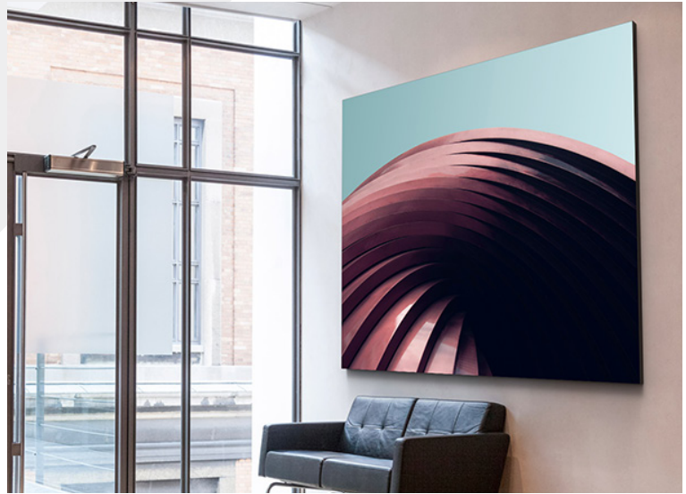
On The Wall (Custom Art)