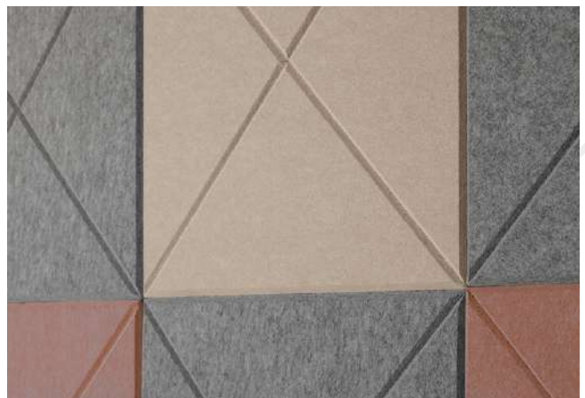
Vee Tiles | Colors 444 (Gray), 468 (Vanilla), 487 (Blush)

CDPH (CA 01350) Compliant; TVOC: <0.5 mg/m 3 Ecospecifier GreenTag Compliant; TVOC: 0.015 mg/m 2 /hr (ASTM D5116)