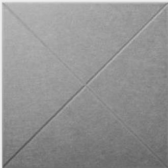
Vee Tile | Color 444 (Gray)