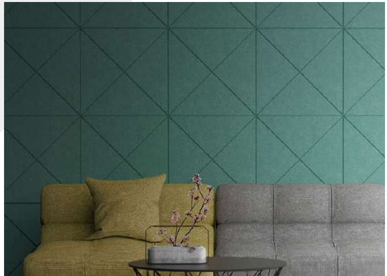
Vee Tiles | Color 338 (Jade)