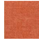
295 | Dark Orange