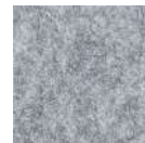
442 | Speckled Gray