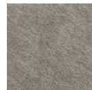
402 | Taupe