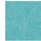
325 | Viridian Green