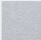
101 | Frost