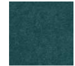
330 | Ivy