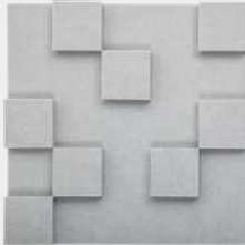
Topo Tile: Pixel I Color 101 (Frost)