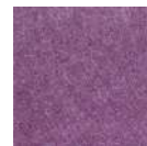
576 | Magenta