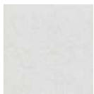
500 | White