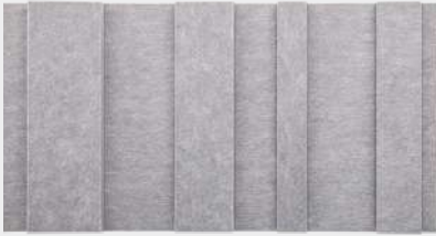
Topo Tile: Barcode I Color 444 (Gray)