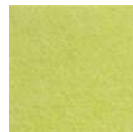
381 | Lime Green