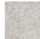
454 | Mushroom