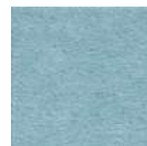
551 | Teal