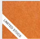
151 | Orange