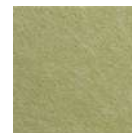
579 | Olive Green