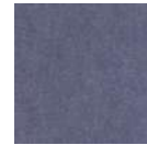
276 | Lavender