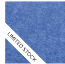
273 | Blue