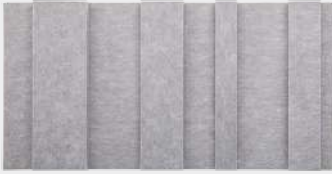
Topo Tile: Barcode