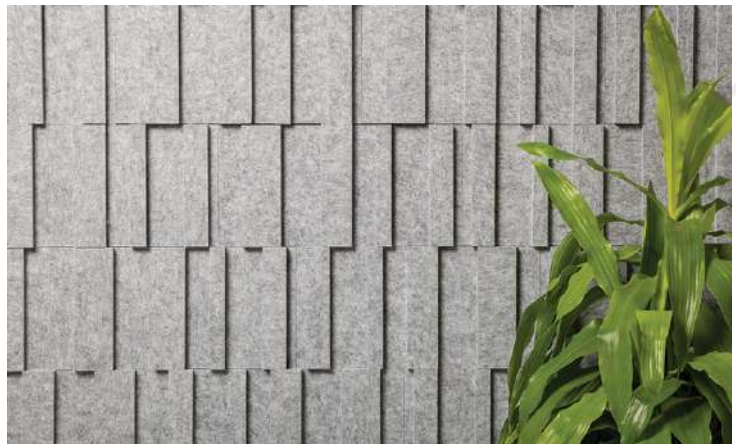
Topo Tile: Barcode I Color 442 (Speckled Gray)

CDPH (CA 01350) Compliant; TVOC: <0.5 mg/m3 Ecospecifier GreenTag Compliant; TVOC: 0.015 mg/m2/hr (ASTM D5116)