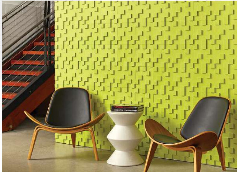
Topo Tile: Pixel I Color 381 (Lime Green)