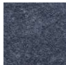
365 | Navy