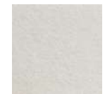
908 | Ivory