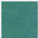
338 | Jade