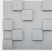
Topo Tile: Pixel