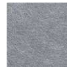
444 | Gray