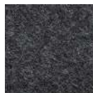
542 | Charcoal