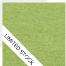
362 | Green