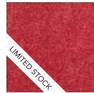
258 | Red