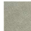
580 | Sage