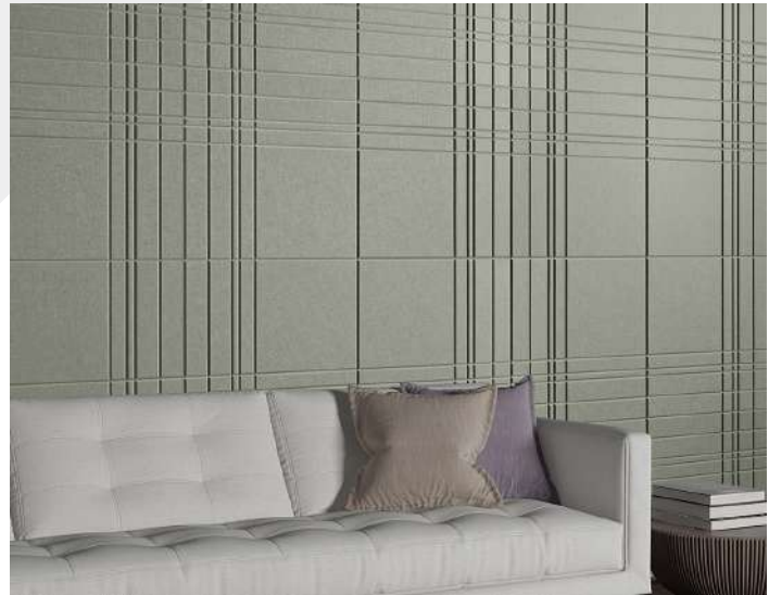
Tartan Tiles | Color 580 (Sage)