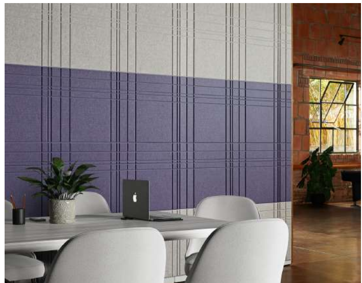
Tartan Tiles | Colors 276 (Lavendar), 444 (Gray)

CDPH (CA 01350) Compliant; TVOC: <0.5 mg/m3 Ecospecifier GreenTag Compliant; TVOC: 0.015 mg/m2/hr (ASTM D5116)