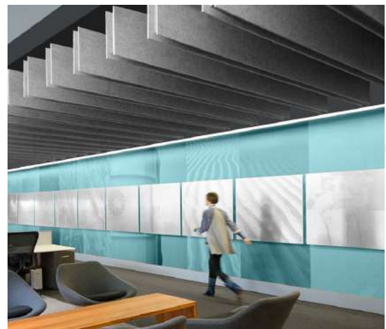
H-Baffle I Color 444 (Gray)

CDPH (CA 01350) Compliant; TVOC: <0.5 mg/m3 Ecospecifier GreenTag Compliant; TVOC: 0.015 mg/m2/hr (ASTM D5116)