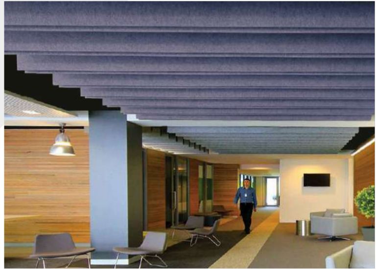
H-Baffle I Color 276 (Lavendar)