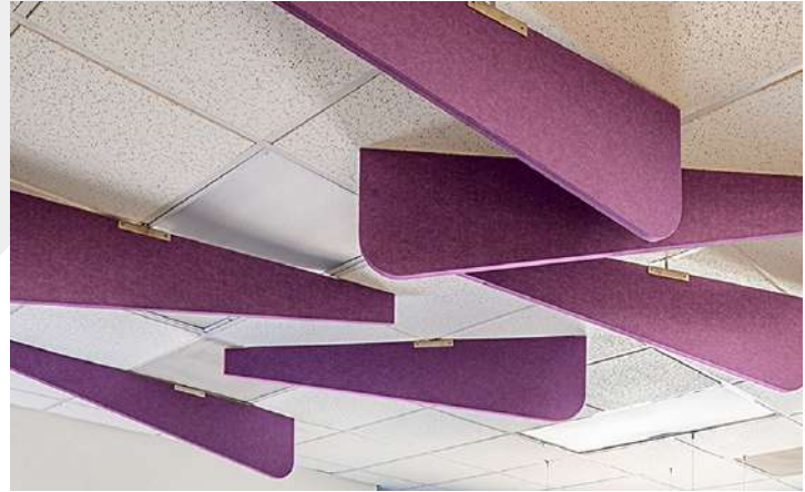
EchoBlade Swoop 47 | Color 576 (Magenta)