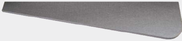
EchoBlade Swoop 47 | Color 444 (Gray)