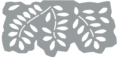
Vines 23 | 23" x 11.5"