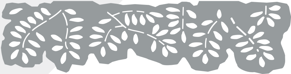
Vines 47 | 47" x 11.5"