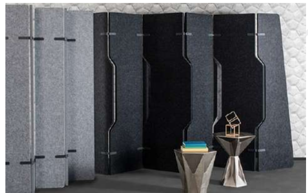
Platoon Partition I Color 542 (Charcoal)

CDPH (CA 01350) Compliant; TVOC: <0.5 mg/m 3 Ecospecifier GreenTag Compliant; TVOC: 0.015 mg/m 2 /hr (ASTM D5116)