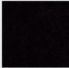
550 | Onyx