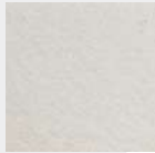
908 | Ivory