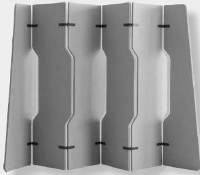
Platoon Partition I Color 101 (Frost) with Charcoal Hardware