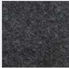
542 | Charcoal