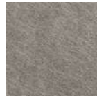
402 | Taupe