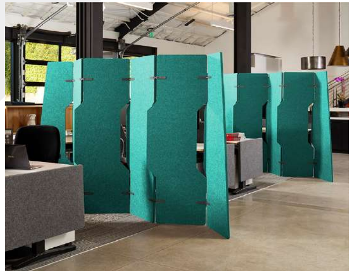
Platoon Partition I Color 325 (Viridian Green) with Charcoal Hardware