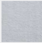
101 | Frost