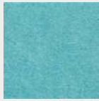
325 | Viridian Green