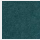
330 | Ivy