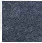
365 | Navy