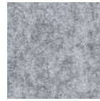
442 | Speckled Gray