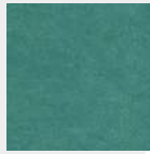
338 | Jade